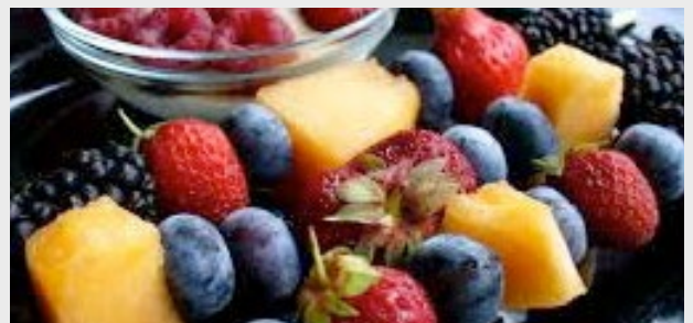
Figure 1 - Foods high in antioxidants 1