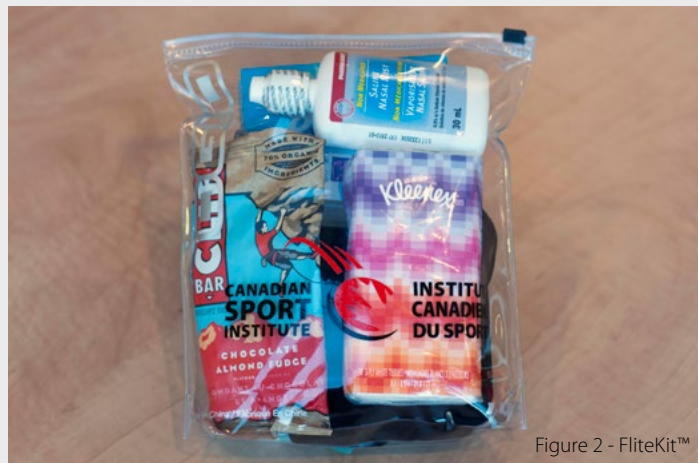
Figure 2 - FliteKit™

FliteKits™ (Figure 2) are loaded with items (including some of the items mentioned above) that you will find useful for travel. They are available through the Canadian Sport Institute, please contact your Athlete Services Representative.