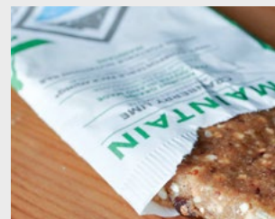
Figure 3 - Snacks